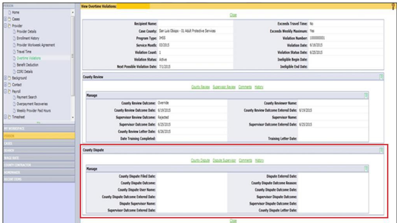
Figure 1 – View Overtime Violations Screen

The County Dispute process is managed in CMIPS utilizing the “County Dispute” section on the View Overtime Violation screen (see Figure 1). Once the SOC 2272 is received by the county from the provider requesting a county dispute process review and the “County Dispute Filed Date” is entered into CMIPS, the county has a total of ten (10) additional business days to complete the “County Dispute” process and enter the outcome in CMIPS. This ten (10) business day period includes the time for the county worker to make their decision as well as the time necessary for the Supervisor to complete their review if the county worker’s decision is to “Override” the violation.