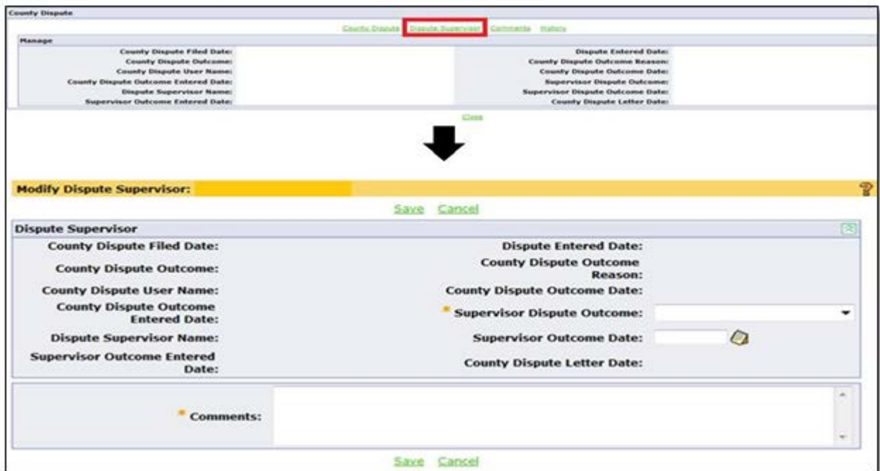
Figure 7: Modify Dispute Supervisor Screen

If the County Dispute Outcome status is “Upheld”, the violation will be upheld and no further action is required. If the County Dispute Outcome is “Override”, a task will be sent to the Supervisor Overtime Violation Work Queue. The Supervisor will need to review the county/IHO user decision from the pop-up Modify Dispute Supervisor screen. This is accessible by selecting the ‘Dispute Supervisor’ link in the “County Dispute” cluster on the View Overtime Violations screen (see Figure 7).