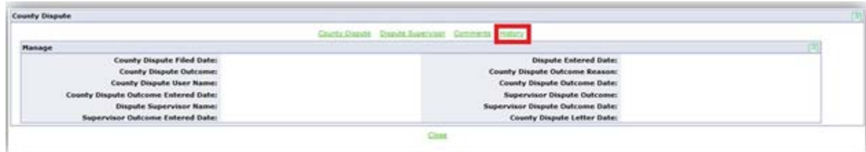
Figure 4: History Link From View Overtime Violations Screen

When the ‘History’ link (see Figure 4) is selected from the “County Dispute Manage” section of the View Overtime Violations screen, the County Dispute History screen (see Figure 5) will display.