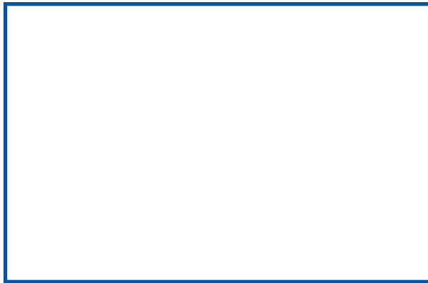
Lub Thawv Nias Xa Ntaub Ntawv ntawm County

Koj yuav tsum ua lis koj xav tau ntawm koj tus kheej. Ua kom zoo rau tus koj hlub.